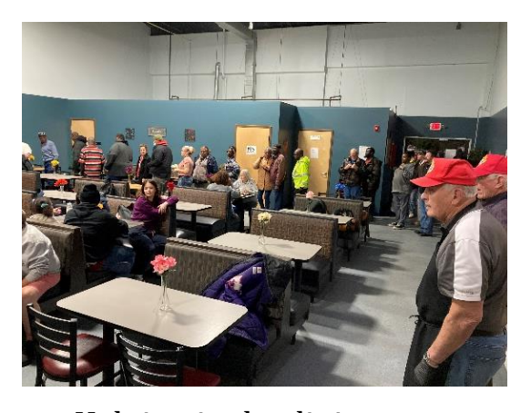
Helping in the dining area