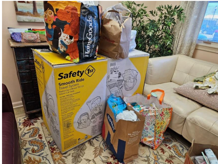
Car seats donated by brother Knights