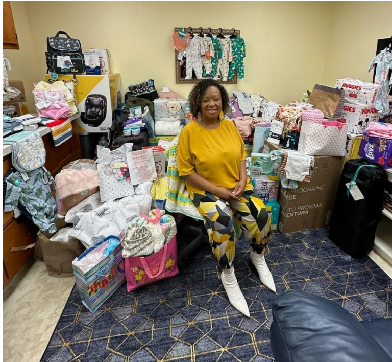
Gifts collected at SFDS