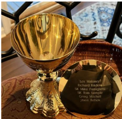
Memorial Chalice and Paten