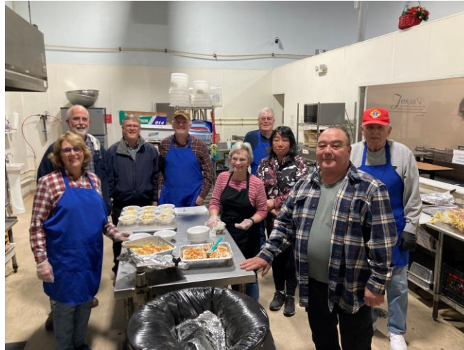
Serving dinner at Halo in November

First, a picture left out of the December newsletter of our brothers helping at Halo.