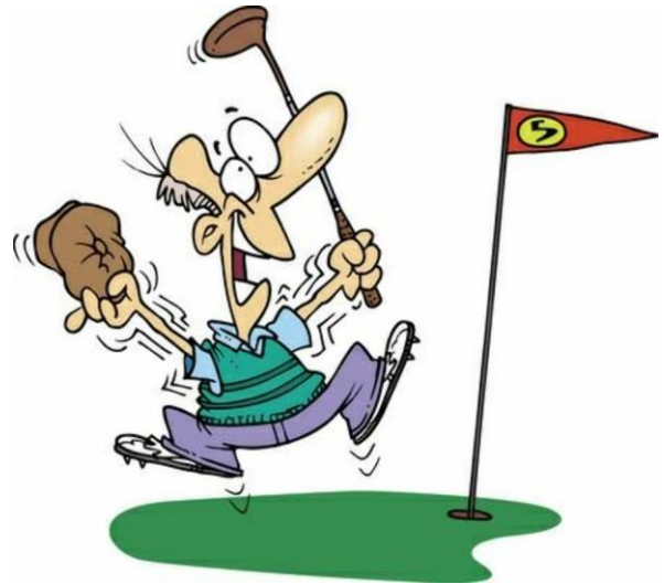
JH Golf Tournament - another success. Brother Knights and many of their wives worked with the Sisters in the annual event. More next month.