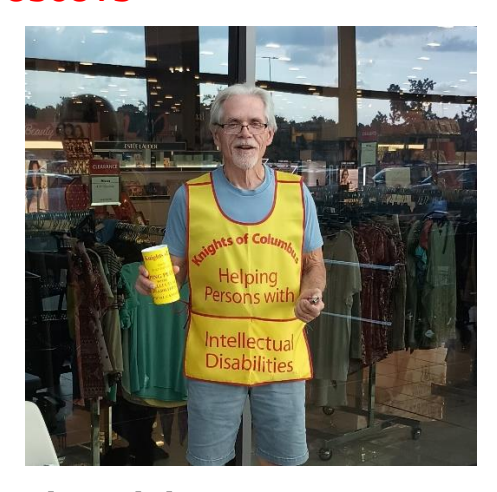
$823 Collected for Intellectual Disabilities