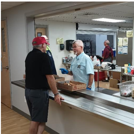
Serving the crabs and serving the beer (and other refreshments)