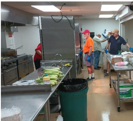
The kitchen at serving time