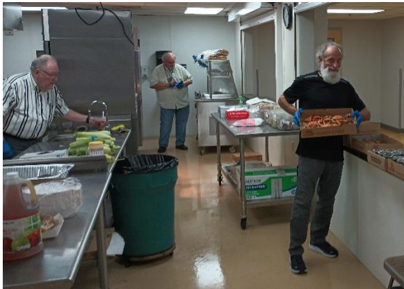
The setup starts it all up