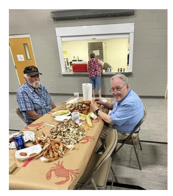
Some seemed to enjoy a lot!!!