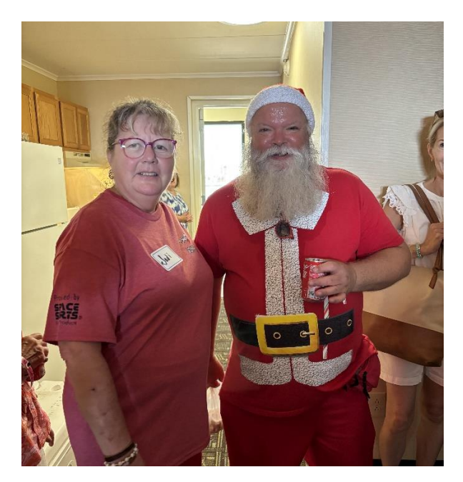
Some came a long way to enjoy!!!